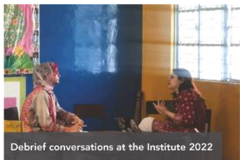
Debrief conversations at the Institute 2022

This year trainee Fellows taught at four Summer School sites in Bhara Kahu for three weeks. Fellows' classrooms were formally observed by their coaches and other experts followed by a debrief conversation to give them real-time feedback.