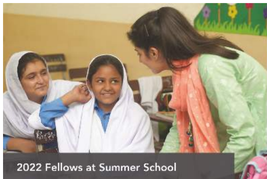
2022 Fellows at Summer School