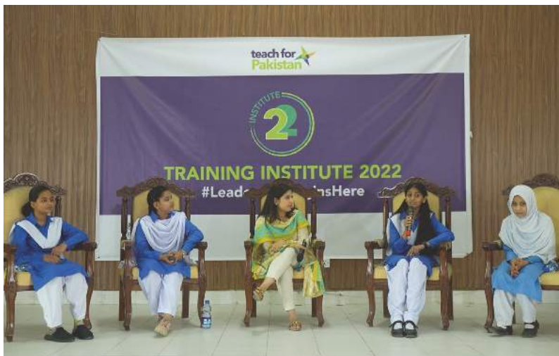
Student panel at the Institute 2022

We are so grateful to the Saidpur community and parents who opened the doors of their homes for us and welcomed the new members of the community into this movement!