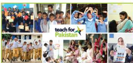
Alumni Induction Ceremony Highlights

A reel of inspiring moments from the Alumni Induction Ceremony for the 2018 Cohort.