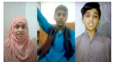
Chapter One: 2018 - 2020

Reflections on the Fellowship experience with insights into the 2018 Cohort's Leadership Journey.